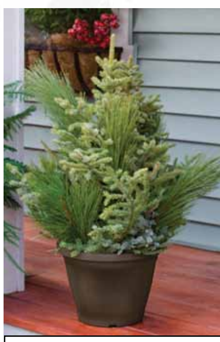
12" Standard Mixed Greens