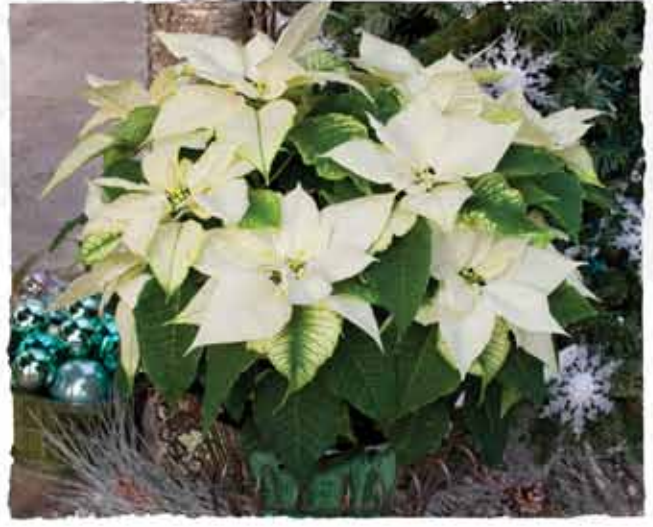
10" Fireside Poinsettia