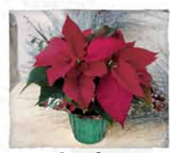
4.5" Desk Top Poinsettia