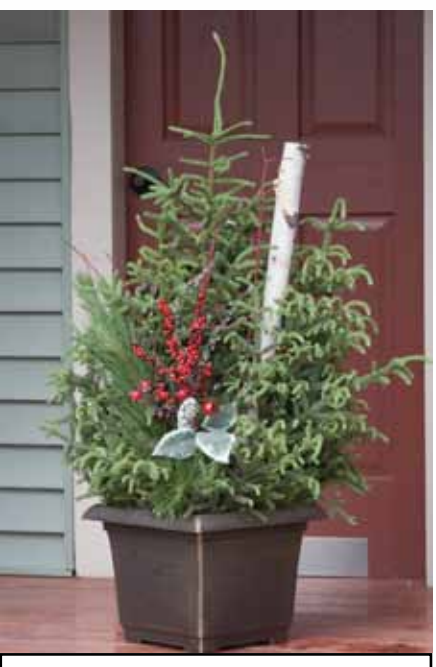
12" Premium Square Mixed Greens